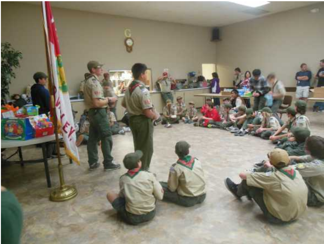
Adults Celebrate too!