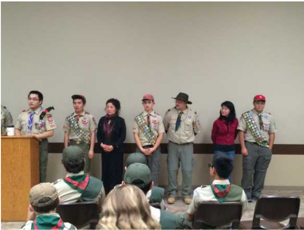
Saluting the new Eagle Scouts