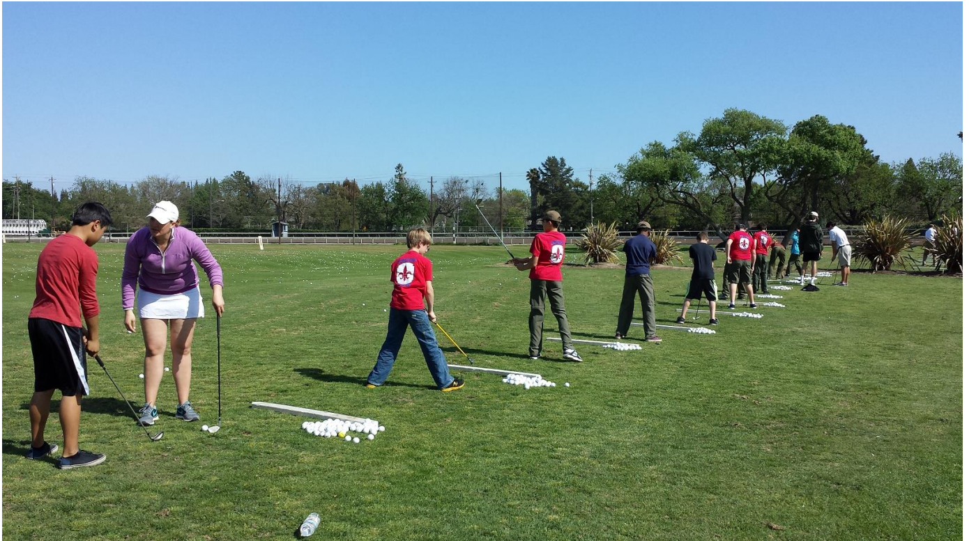
First Golfing meeting at Pleasanton Golf Center Not as easy as it looks but great fun!